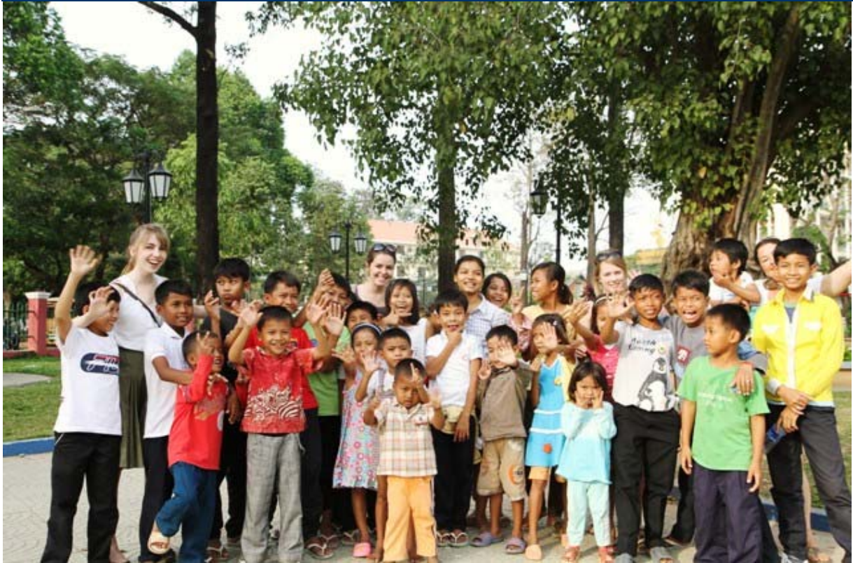
GROUP OF VOLUNTEERS AND KIDS